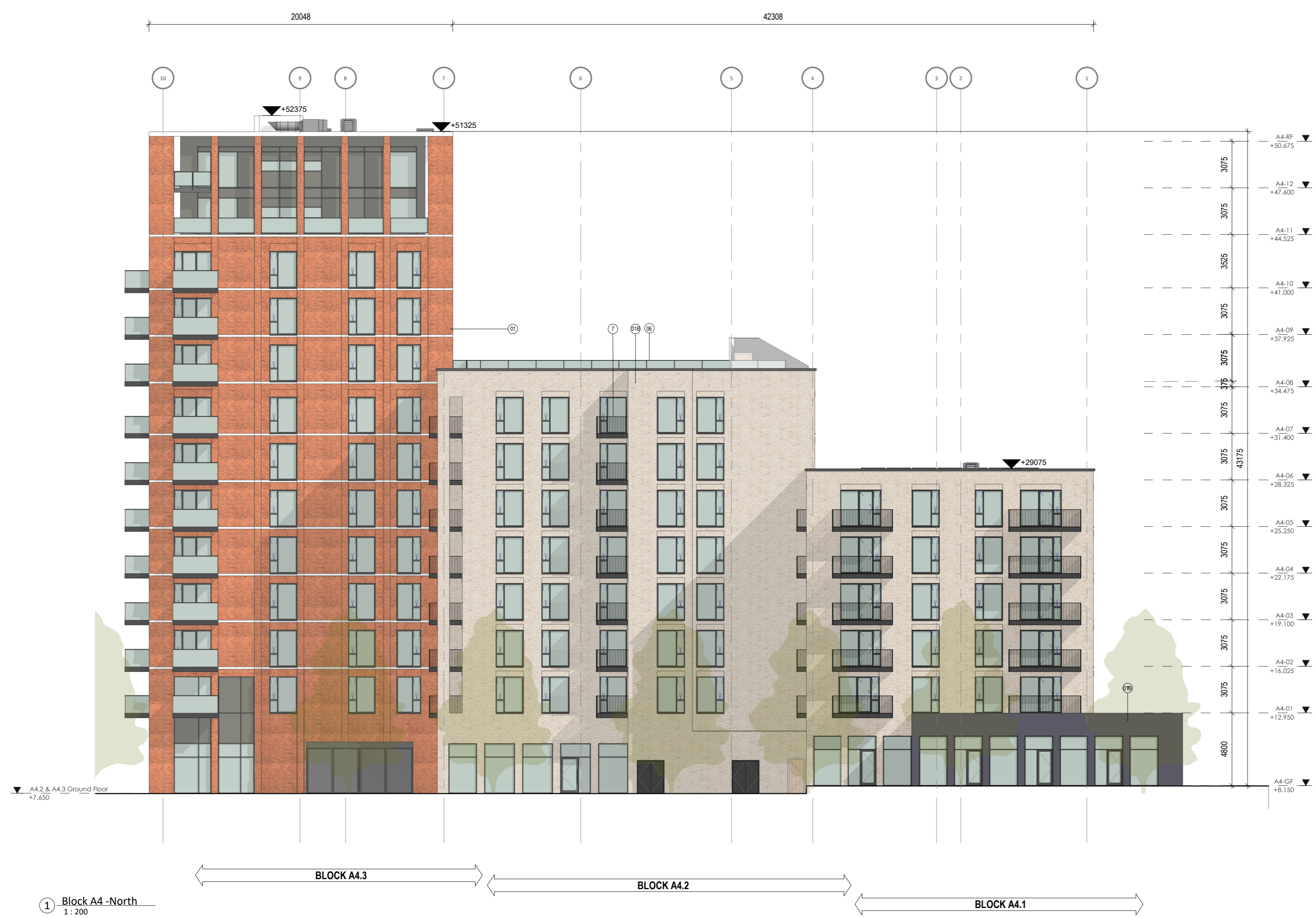
1 Block A4 - North 1:200