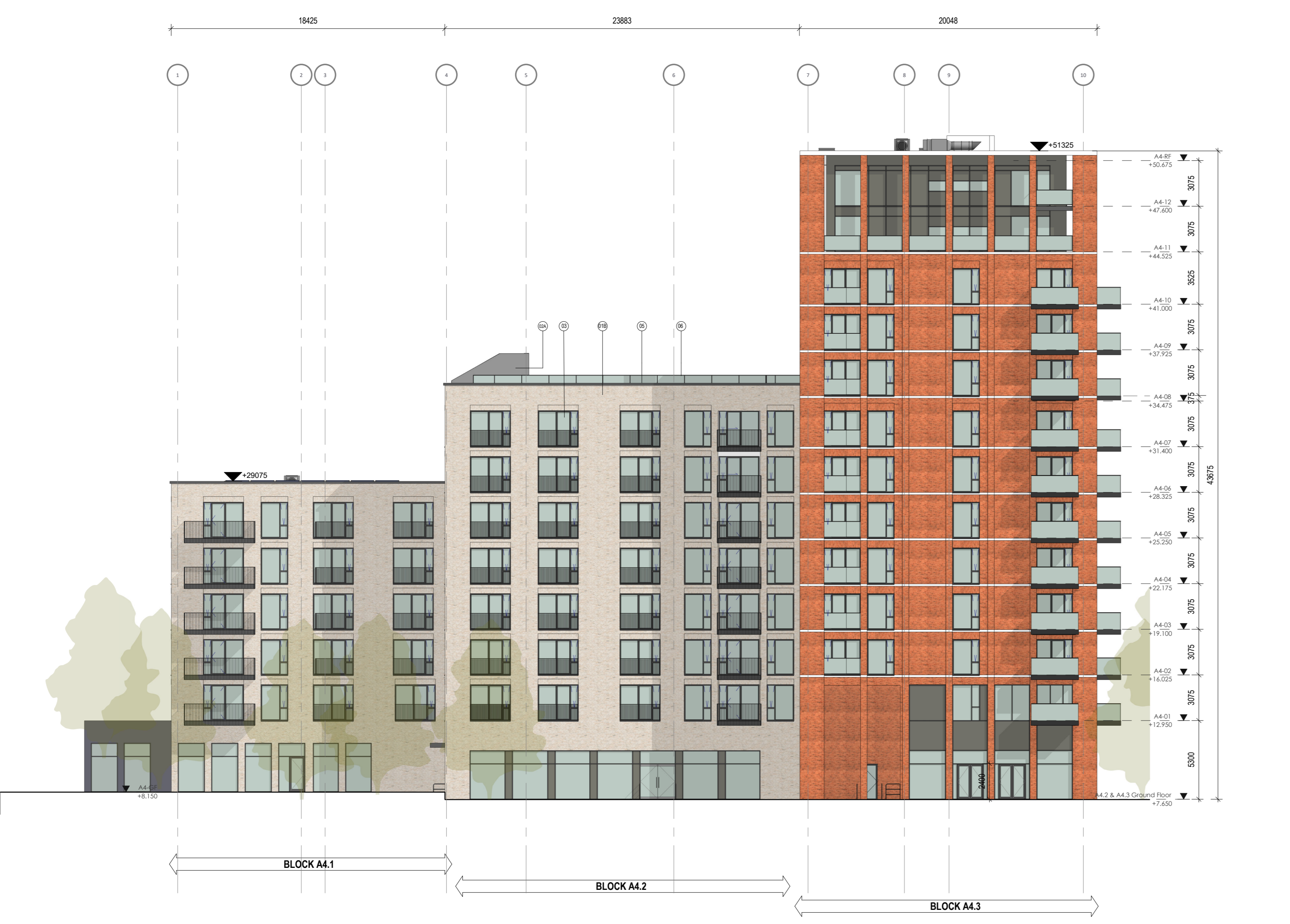
3 Block A4 - South 1:200