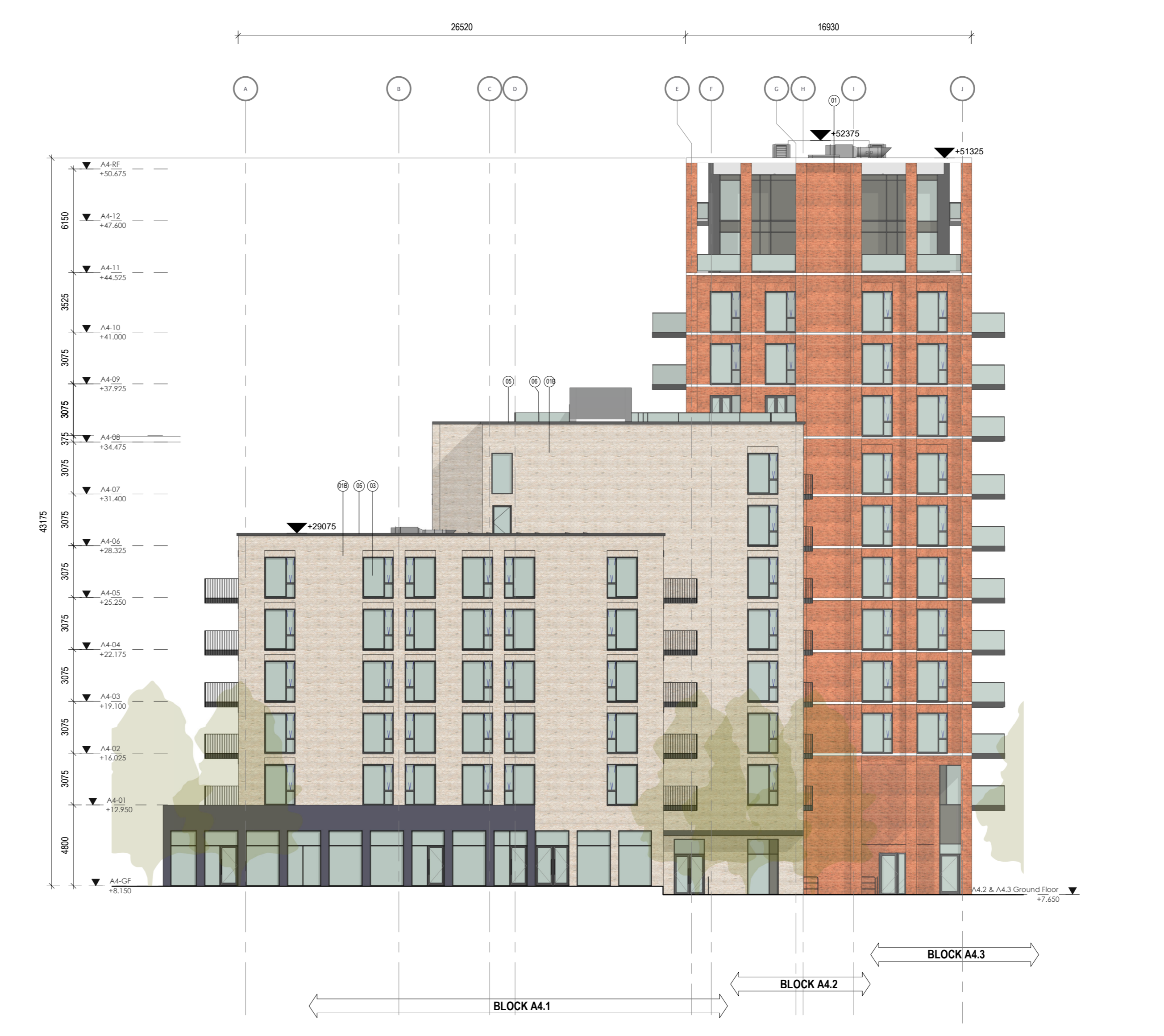
4 Block A4 - West 1:200