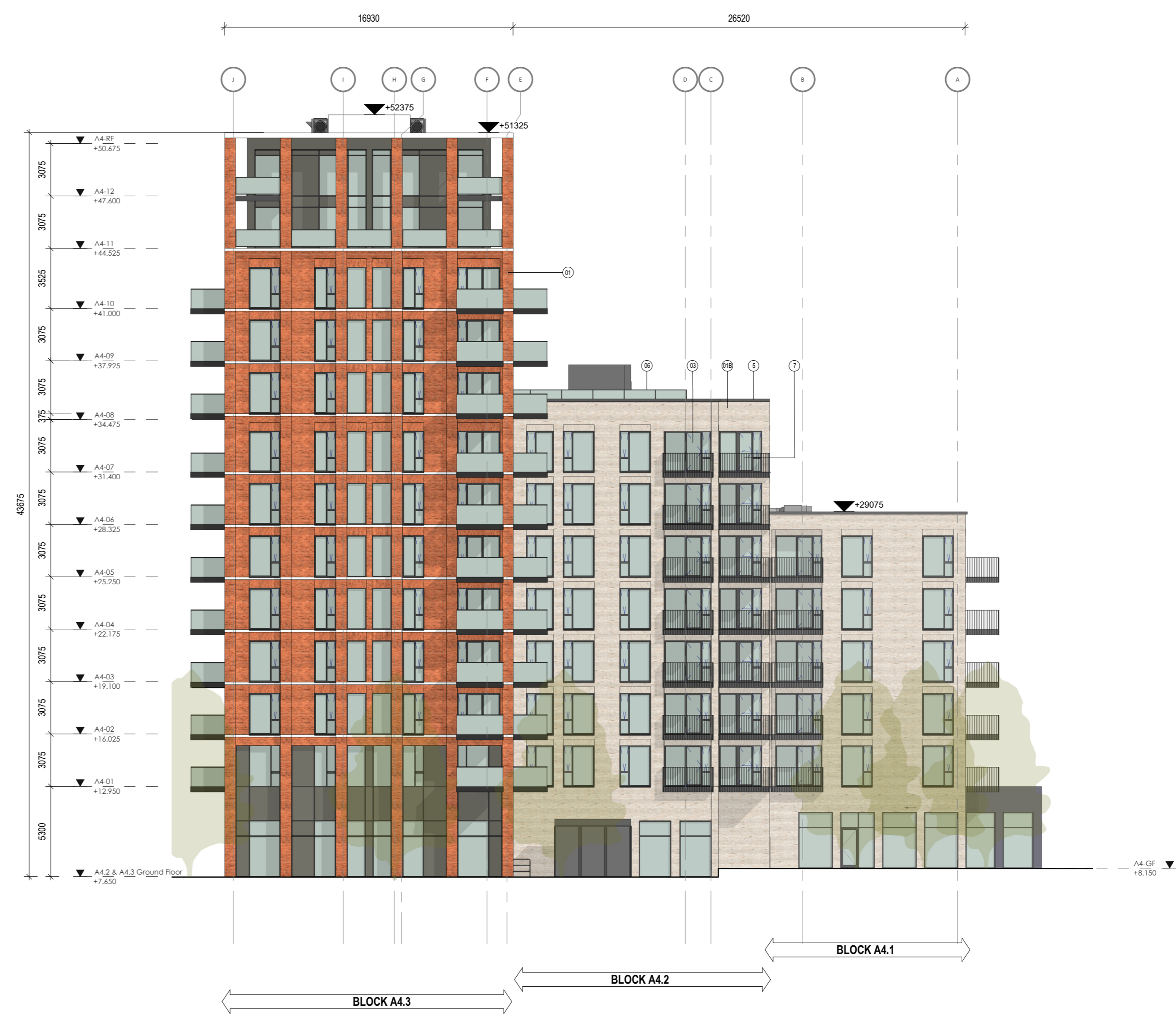
2 Block A4 - East 1:200